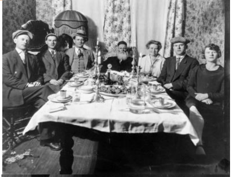
Pearl Family Seder 1929